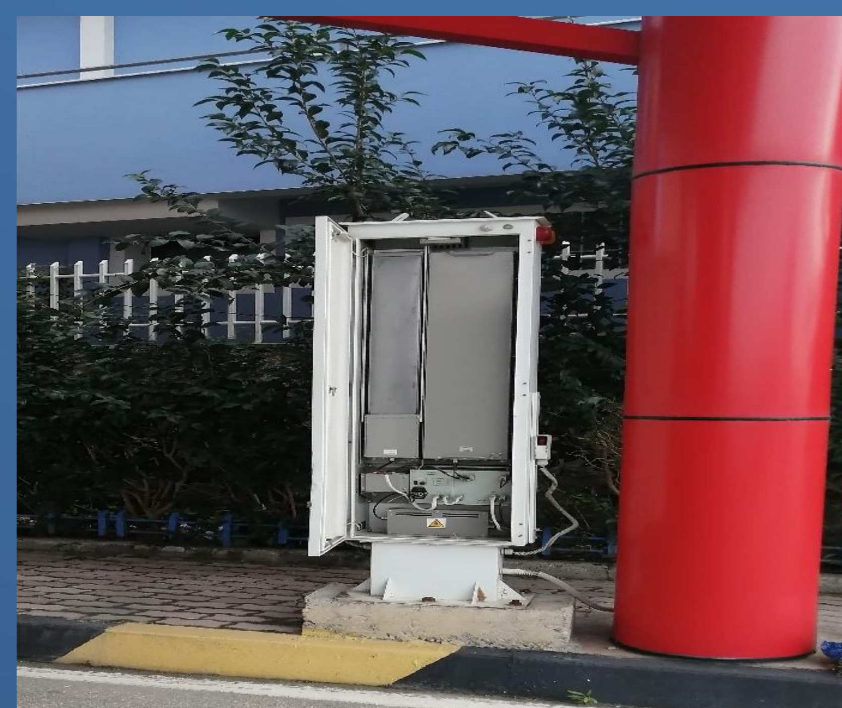
Vlora RPM Master and Slave Pillars